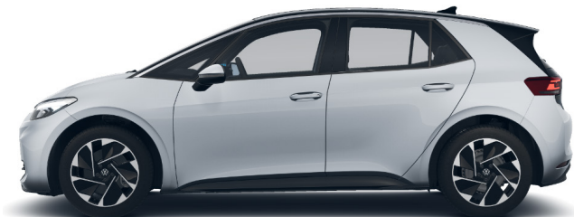
Scale Silver Metallic** 1TA1