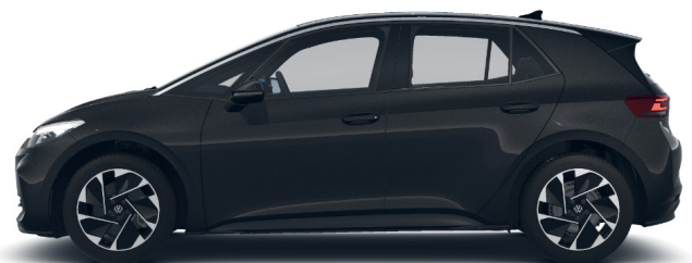
Mythos Black Metallic** 0EA1