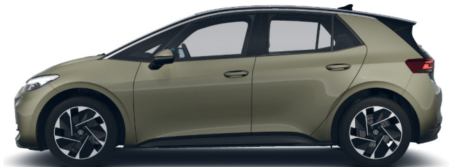
Dark Olivine Green Metallic** H0A1