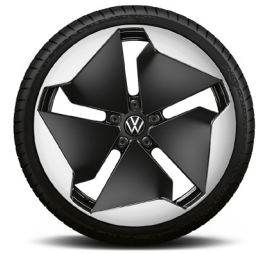
STANDARD ON ID.3 Pro S Plus 20" 'Sanya' alloy wheels 7.5J x 20 Tyres: 215/45 R20