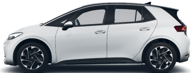
Glacier White Metallic** 2YA1