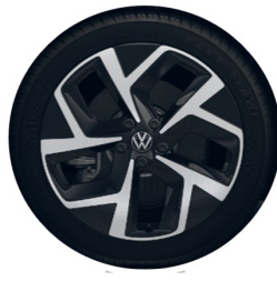
STANDARD ON ID.3 PRO S 19" 'Wellington' alloy wheels 7.5J x 19 Tyres: 215/50 R19