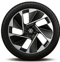
STANDARD ON ID.3 Pro Plus 18" 'East Derry' alloy wheels 7.5J x 18 Tyres: 215/55 R18