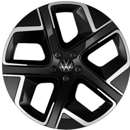
OPTIONAL ON R LINE 21" York Alloy in Schwarz PJ4