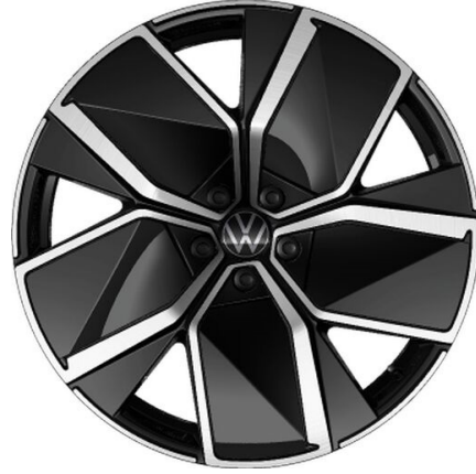
OPTIONAL ON R LINE & R EHYBRID 21" Leeds Alloys Leeds 9.5J x 21, Black, diamond-turned, tires 285/40 R21 PJ5