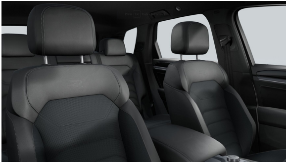
"Vienna" leather Soul Black - Crystal Grey