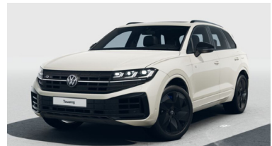
Sechura Beige Metallic