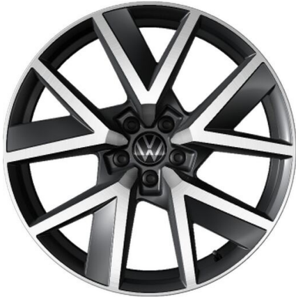
STANDARD ON R-LINE & R EHYBRID 20" 'Braga' alloy wheels, in 'Black' with diamond turned surface 9J x 20 Tyres: 285/45 R20

The addition of optional extras may result in the vehicle increasing in Co2 g/km and therefore, attracting a higher rate of VRT than described in this product guide. For your exact configuration value, both Co2 g/km and RRP, please visit volkswagen.ie configurator.