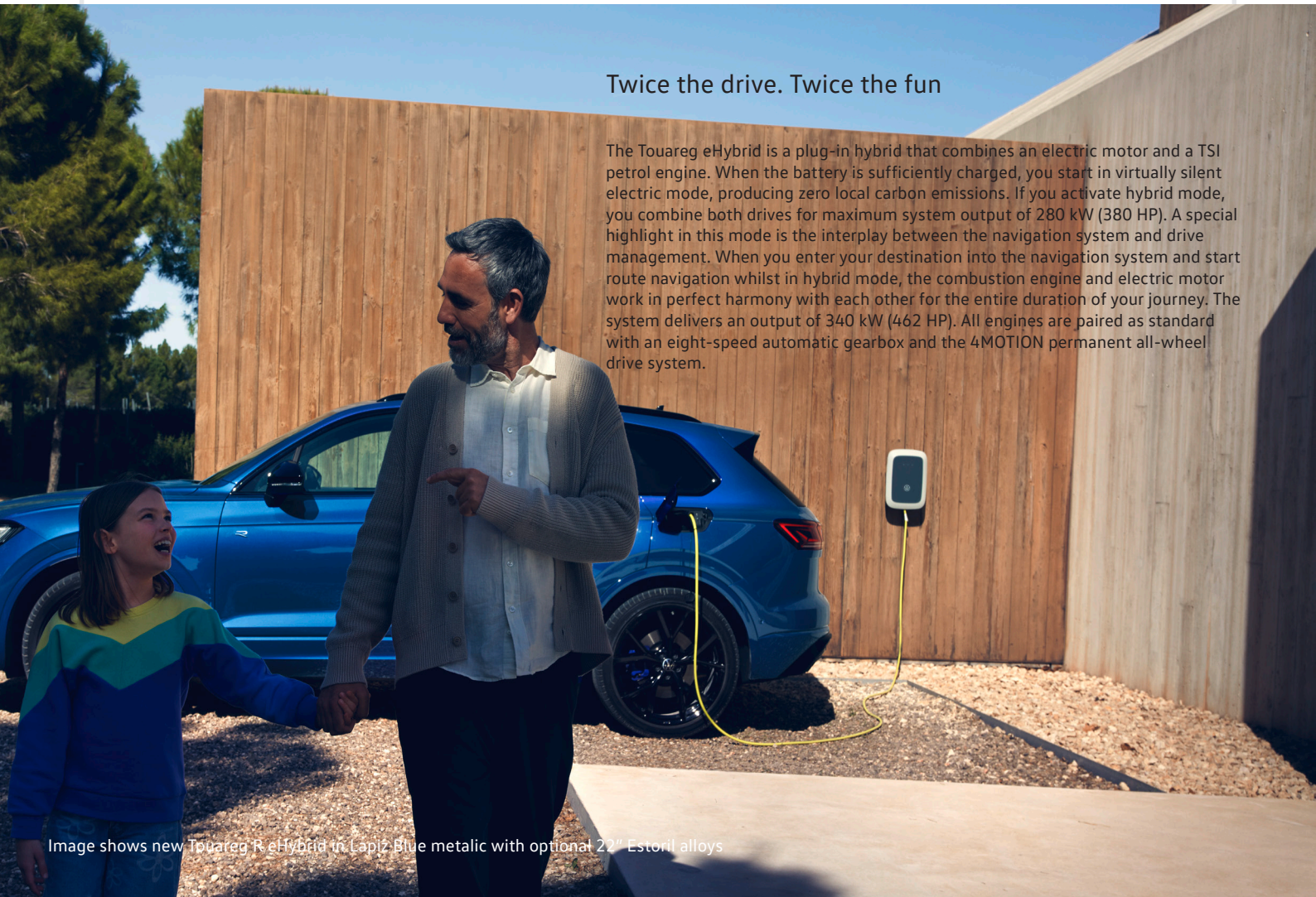
Image shows new Touareg R eHybrid in Lapiz Blue metallic with optional 22" Estoril alloys

The Touareg eHybrid is a plug-in hybrid that combines an electric motor and a TSI petrol engine. When the battery is sufficiently charged, you start in virtually silent electric mode, producing zero local carbon emissions. If you activate hybrid mode, you combine both drives for maximum system output of 280 kW (380 HP). A special highlight in this mode is the interplay between the navigation system and drive management. When you enter your destination into the navigation system and start route navigation whilst in hybrid mode, the combustion engine and electric motor work in perfect harmony with each other for the entire duration of your journey. The system delivers an output of 340 kW (462 HP). All engines are paired as standard with an eight-speed automatic gearbox and the 4MOTION permanent all-wheel drive system.