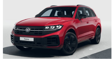
Chili Red Metallic