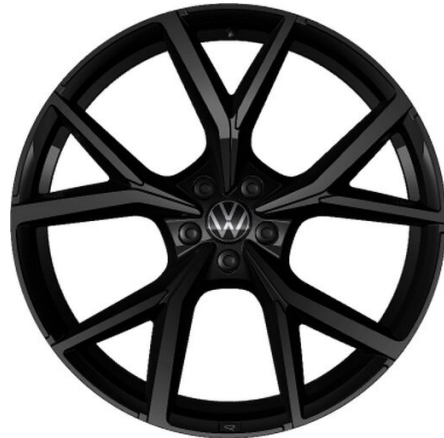
OPTIONAL ON R EHYBRID 22" Estoril Alloy in Schwarz PJ7 / PJ9

The addition of optional extras may result in the vehicle increasing in Co2 g/km and therefore, attracting a higher rate of VRT than described in this product guide. For your exact configuration value, both Co2 g/km and RRP, please visit volkswagen.ie configurator.