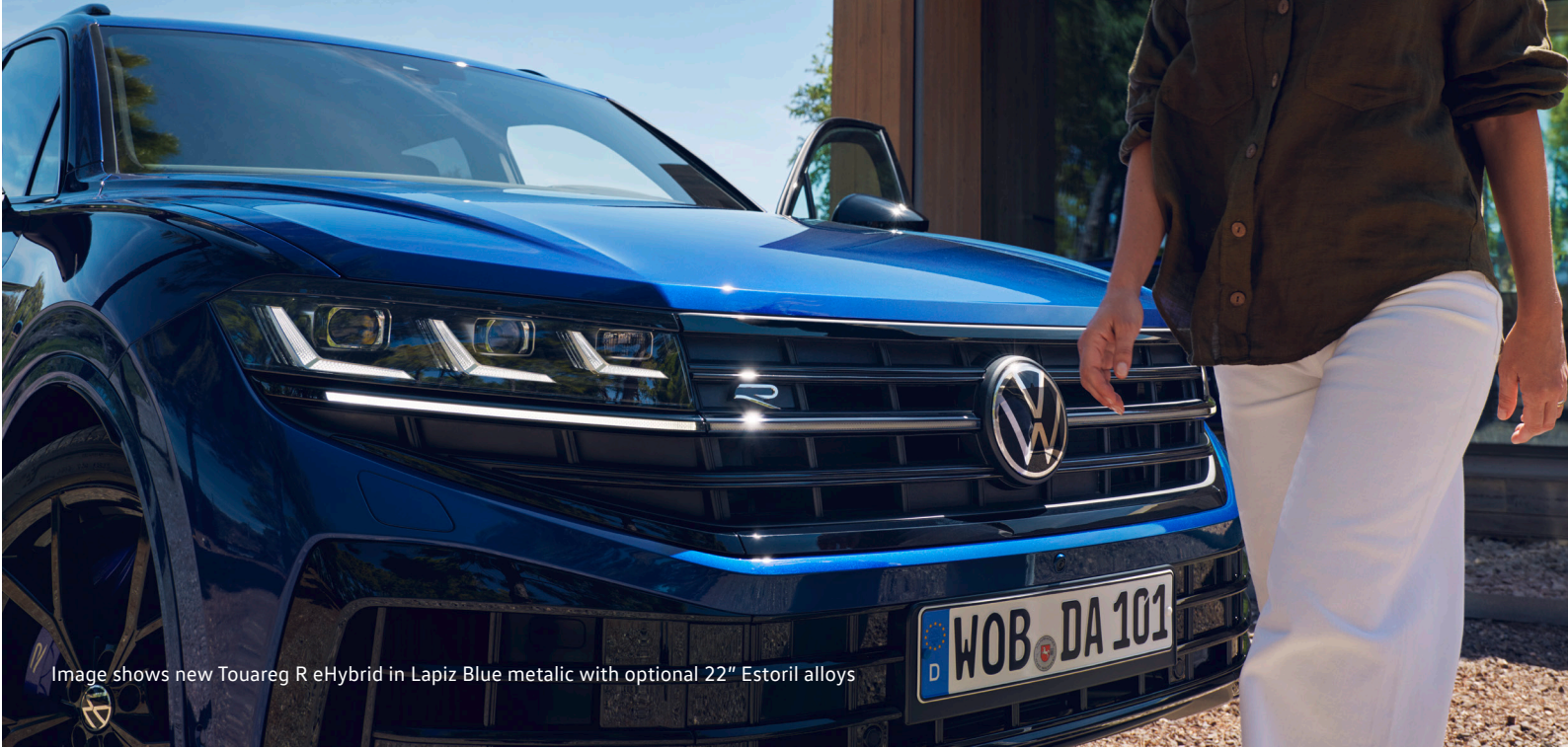
Image shows new Touareg R eHybrid in Lapiz Blue metallic with optional 22" Estoril alloys

The HD matrix headlight not only provides better visibility at night but also supports you when driving. More than 19,000 individually controllable LEDs are used for each headlight. This enables your Volkswagen to project markings onto the road, for example, when the high beam is switched on. The HD matrix headlight has a special light animation ready for you.